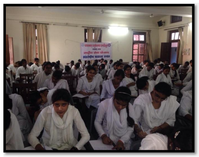
Inter-faculty Essay Writing Competition

The volunteers of the all the faculties took active part in this Competition. During this week Volunteers and Program officers of Faculty of Arts also organized Inter-Faculty Skit Competition on 12<sup>th</sup> September 2015. The theme of the competition was "Women Education and Social Development". In this competition volunteers of Engineering Faculty got first position. Volunteers of Commerce and Science faculty got second and third position.