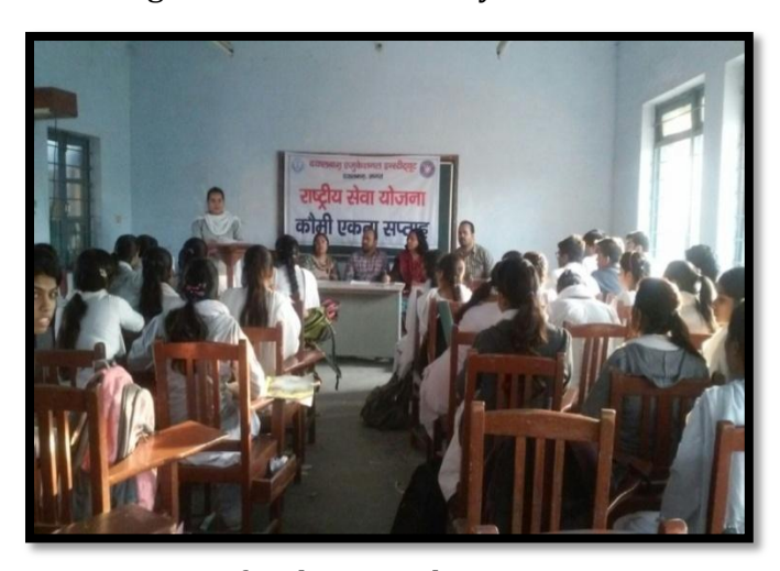
Inter-faculty Speech Competition

National Integration Week was celebrated from 19 to 25 November 2015. On this occasion the NSS volunteers took active part in Inter-faculty Essay/ Slogan and Poster Making Competition on "Intolerance and Freedom of Expression" and also in Inter-faculty Speech Competition on National Integration and Democracy".