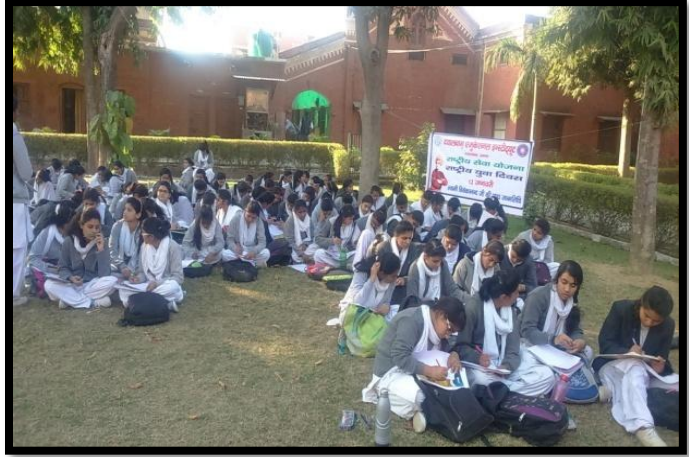
Inter-faculty Essay Writing Competition