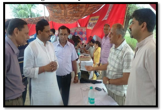
Employment & Career Counselling