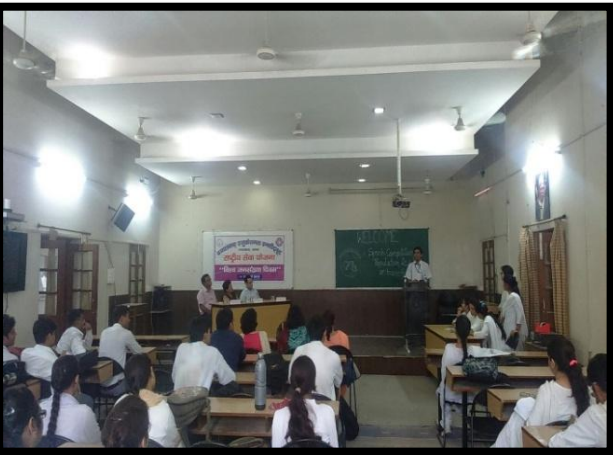
Speech Competiton on Wprld Population Day