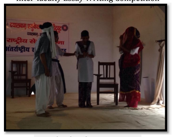
Inter-faculty Skit Competition