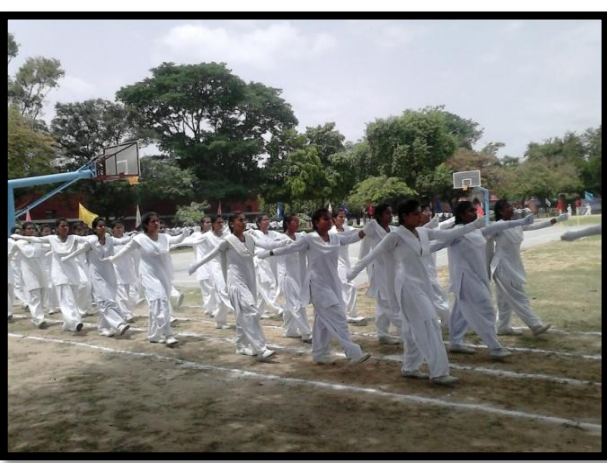
March Past Performance