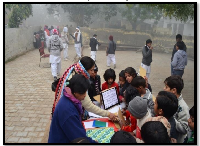
Hole-in-the-Wall in Slums