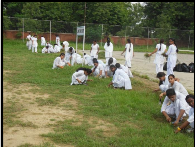
Shramdaan by Volunteers