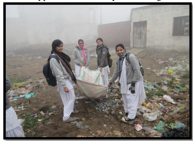
Cleaning in Adopted Slums