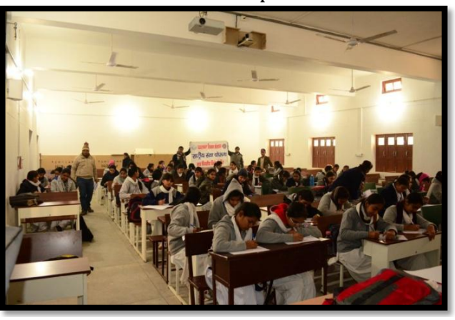
Essay Writing/ Poster Making Competition