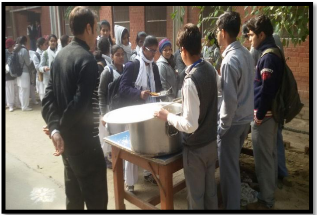
Food Distribution in Camp