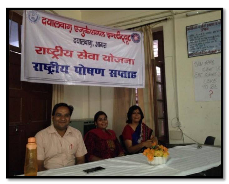
Invited Talks on Nutrition and Health by Experts

The NSS Cell of the Institute observed "National Nutrition Week from 1-7 September 2015". To mark this event, the Volunteers and Program officers of Faculty of Arts organized a Invited Talk of on the topic "Nutrition, Health and Social Development" on 7<sup>th</sup> September 2015. A large number of NSS volunteers from all the faculties attended this program.