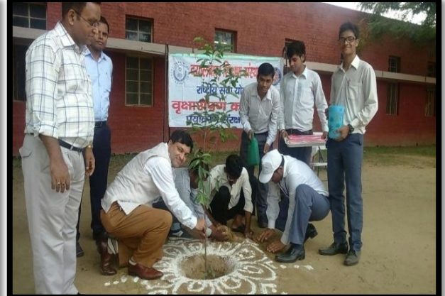
Tree Plantation by Guests, Institute Authorities and Volunteers