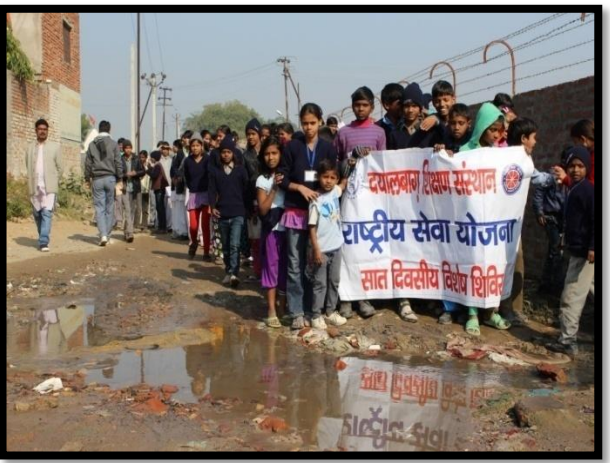
Jan Jagran Rallies in Villages and Slums