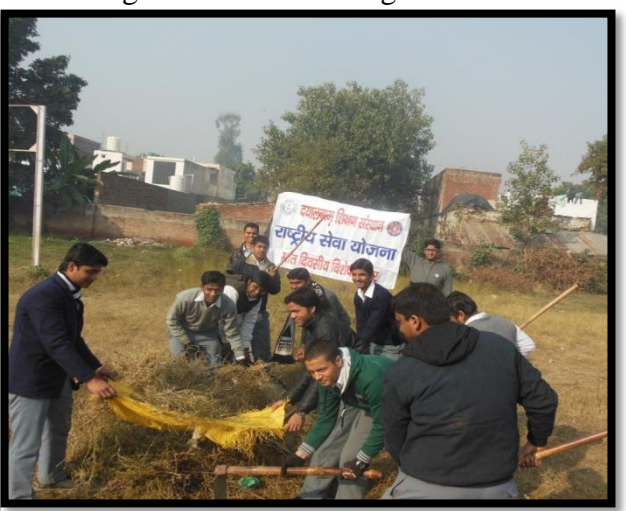
Cleanning in Adopted Villeges