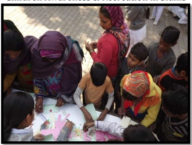
Vocational Training to Villagers