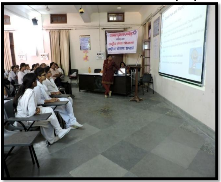
Volunteers Attending Invited Talk