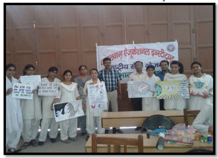
Inter-faculty Poster/ Slogan Writing Competition