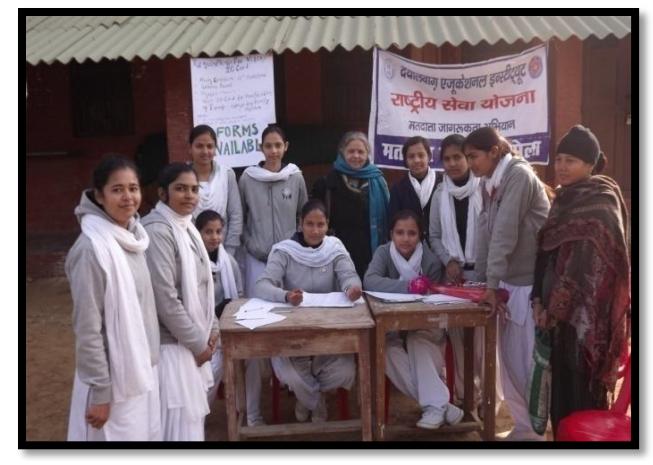
र्यात्वव शिव तत्वा कि स्थाप रक्ट्रीय सेवा योजव दिवसीय विश्व स्थाप कृतिक