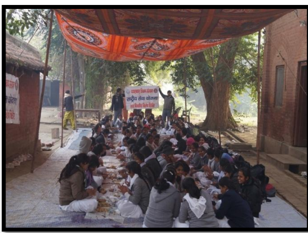
Volunteers in Camp Kitchen