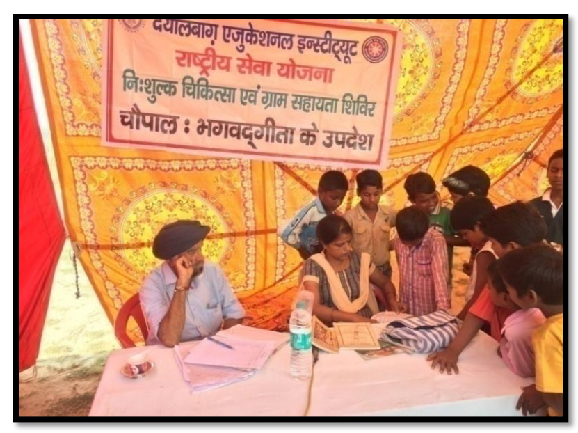
Chaupal: Bhagvad Geeta Ke Updesh