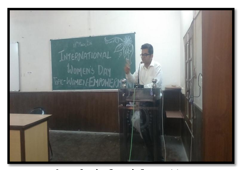
Inter-faculty Speech Competition

International Women's Day was celebrated on 8<sup>th</sup> March 2016. On this occasion, NSS Volunteers of various faculties organized an Awareness Campaign on Social Evils and Problems of Women in adopted Villages and Slums. They also shared their knowledge on Women Empowerment Schemes of the Government with Rural and Urban Women residing in Slums. On this day, NSS volunteers took active part and shared their views on "Women Empowerment" in an Inter-faculty Speech Competition organized in Faculty of Social Sciences of the Institute.