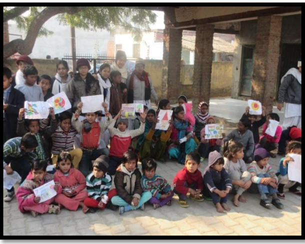
Children Awareness & Recreation in Slums