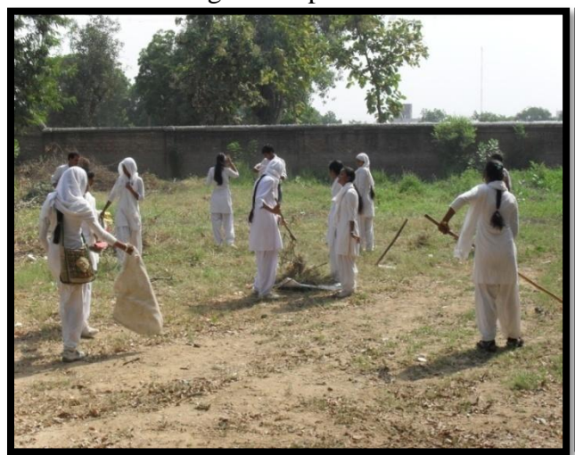
Cleaning of Community Land/ Parks