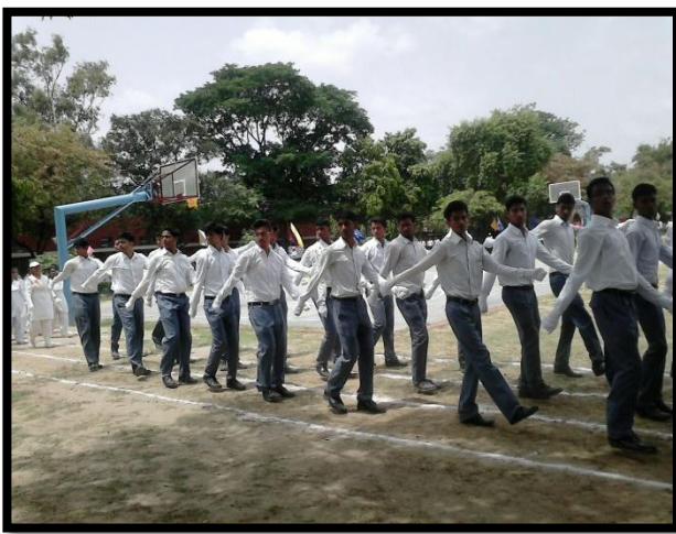
March Past on Republic Day