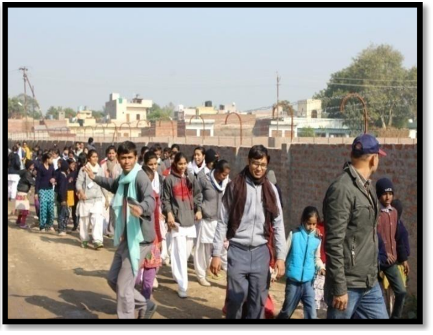
Nukkad Natak in Villages