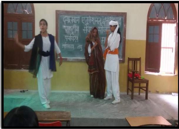
Skit Competition on Environmental Issues